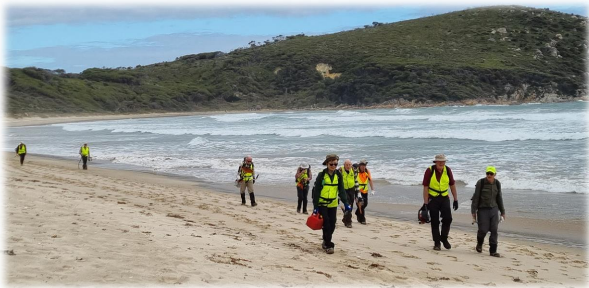
BTAC Volunteers on Squeaky Beach