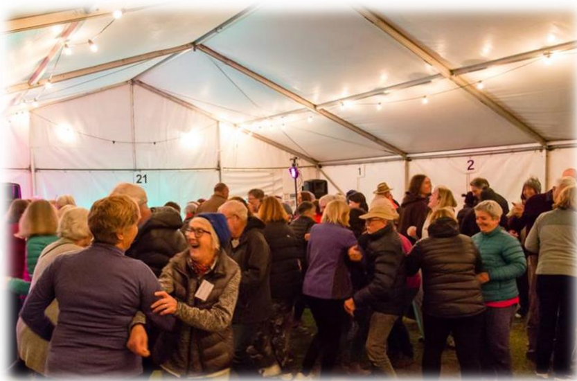
Doing the Polka with 'Saiorse'