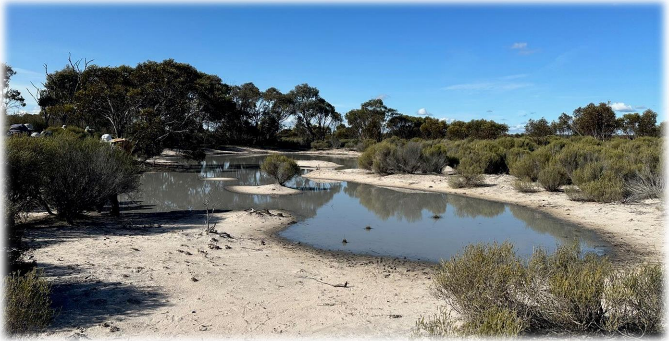
Near Our Final Camp