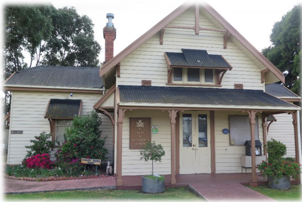
Historic Court House Sunbury

After lunch many of the party inspected the Sunbury Cemetery, ordered like many older cemeteries on strict sectarian lines.