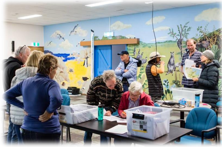
The Check In