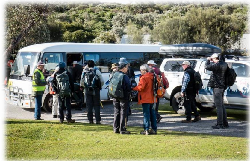
Waiting to Board the Shuttle Bus