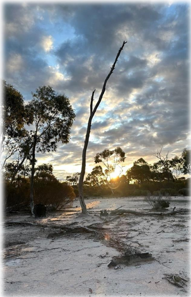
Sunset – Yellow Camp

We were very fortunate that no wind or rain reduced our enjoyment, however, I soon discovered that cold night air means very cold mornings.