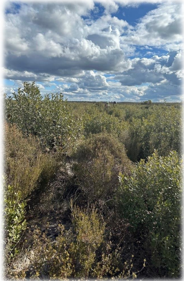
On the Way to Yellow Camp

I started this walk not knowing any of the other members on the journey, but after the four days, I felt like I had made some lovely new friends.