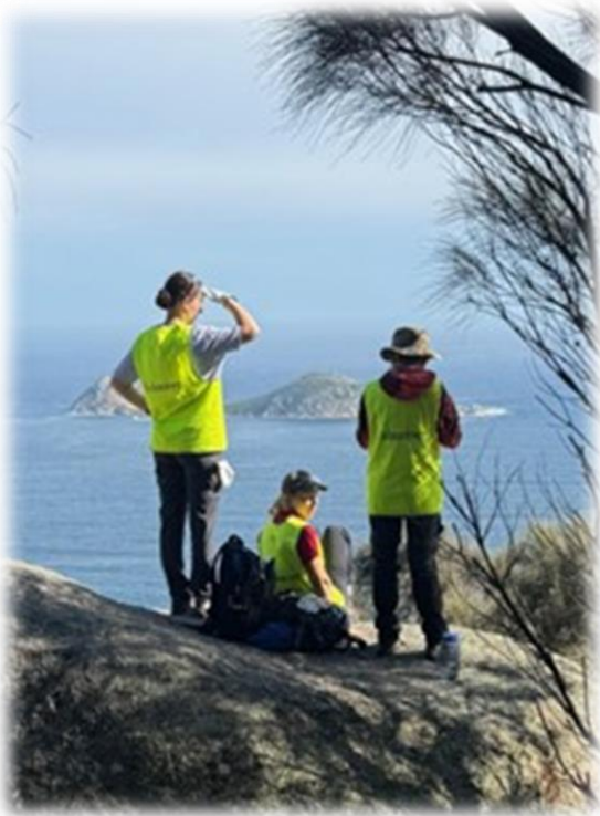
Volunteers at Lookout Rocks

On the weekend of 22-25 August twenty-two BTAC volunteers worked with Parks Victoria Rangers to tidy up some seven kilometres of walking track that will be used for several of the popular walks offered at Federation Walk. Volunteers arrived on Thursday to settle into the Lodge Accommodation kindly provided free of charge by Parks Victoria.